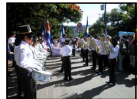
Independence Day Parade

Many more pictures and details are available on-line at: www.atcministries.org